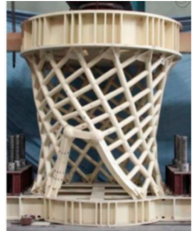
(b) Failed configuration of the test model

From: Yan-Lin Guo, Bo-Li Zhu, Peng Zhou, You-Hao Zhang and Yong-Lin Pi, “Experimental and numerical investigation into the load resistance and hysteretic response of rhombic grid hyperboloid-latticed shells”, Engineering Structures , Vol. 153, pp 700-716, December 2017